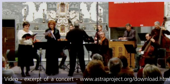
Video - excerpt of a concert - www.astraproject.org/download.html

Reconstructing the sounds of ancient musical instruments has become a reality for archaeologists through the ASTRA (Ancient instruments Sound/ Timbre Reconstruction Application) project which has been facilitated by high-speed transatlantic internet links. A technique called physical modelling synthesis, was used to reconstruct two South American instruments – a Chilean drum and a Peruvian flute – which had not been played for over a thousand-years.