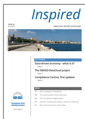
Issue 20, July 2015