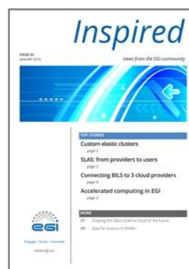
Issue 22, January 2016