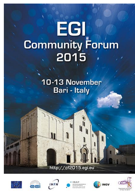
Poster of the EGI Community Forum in Bari

During the first year of EGI-Engage there was also work put into the preparations of the 2016 flagship events, namely: