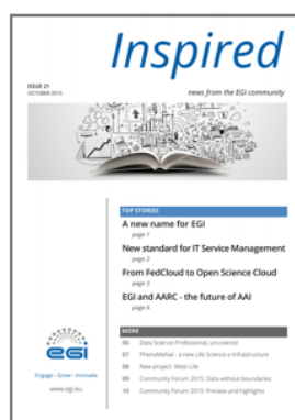
Issue 21, October 2015