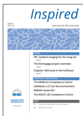
Issue 19, April 2015

The newsletters were distributed by email through the Single Sign-On mailing list and were each open, on average by about 2,000 people. The Click-to-Open rate hovers around 20%.