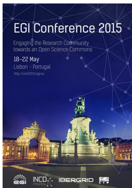
Poster of the EGI Conference in Lisbon

The event was organised by EGI.eu in collaboration with the partners of the Italian National Grid Initiative (INFN, INAF and INGV) and hosted by INFN-Bari. More information about the logistics and organisation procedures is available in a milestone document 36 , on the event website 37 and its Indico pages 38 .