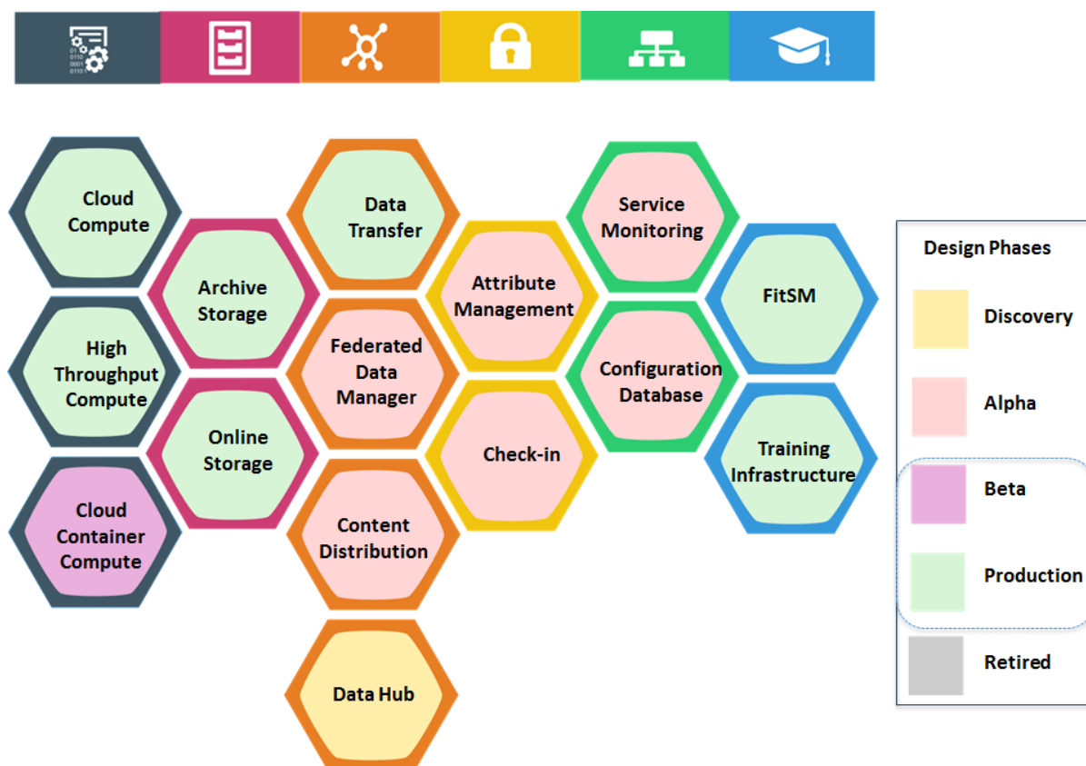
Figure 1 - The EGI Service Portfolio including service states. Services in the catalogue are those in Production and Beta status. The external service catalogue is published on the EGI web site 12 .

Each service can be in a different phase; stages are defined as follows: