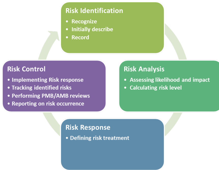
Figure 1 - Four sub-processes of Risk Management in EGI-Engage

The Risk management process, as defined in D1.2, contains four sub-processes: