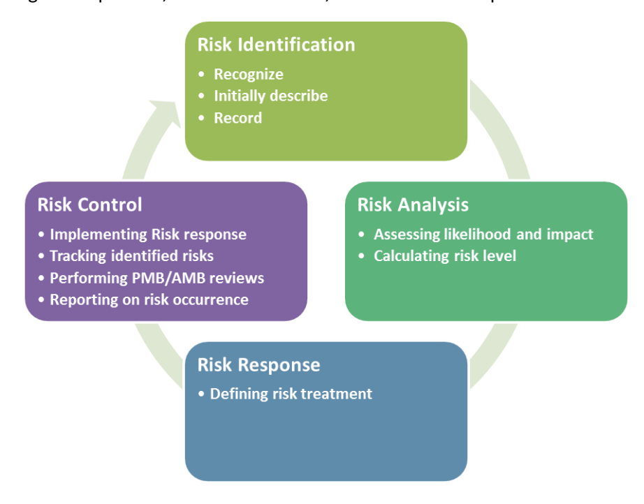
Figure 1 - Four sub-processes of Risk Management in EGI-Engage

The Risk management process, as defined in D1.2, contains four sub-processes: