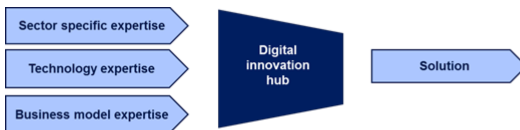
Fig.1 - The Digital Innovation Hub Model 4