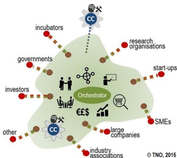
Fig.2 – Element of Digital Innovation Hubs

“Every region, be it more or less industrialised, has a lot to gain; regions should build on their strengths, specificities and know-how to develop their economies, create new jobs, new spin-offs, develop entrepreneurship, and attract investors. They should shape ecosystems covering the entire value chain - from the scientific basis, up to deployment - in order to benefit the citizens, the service sector and the industry. Nevertheless, to take full advantage of such technologies, regions should team up and learn from their experiences, and exploit both expertise and value chain creation complementarities” Cécile Huet, Deputy Head of Unit Robotics & Artificial Intelligence, DG CONNECT, EC.