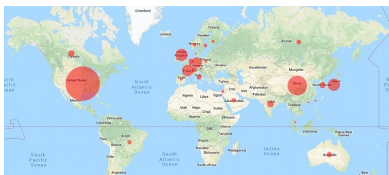
2014 Global HPC Landscape