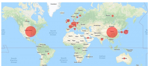
2016 Global HPC Landscape