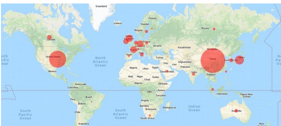
2018 Global HPC Landscape