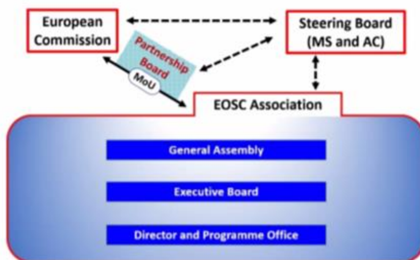
Figure 3: Schematic of EOSC Implementation Phase Governance

The EOSC governance will also include a Steering Board of EU Member State and Associated Country representatives which will liaise with and advise the EOSC Association, the EC and the Partnership Board. The new governance structure is shown in Figure 3.