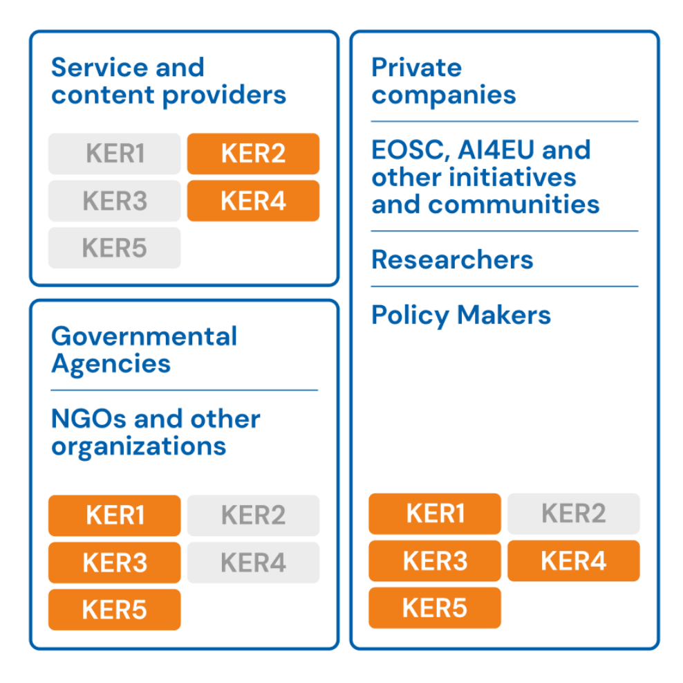
Figure 3. Relation among KERs and Target Groups