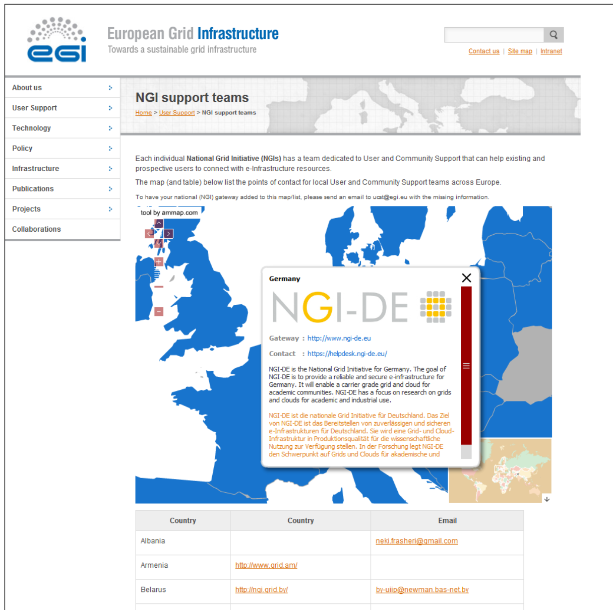
Figure 3. NGI User Support contact information on the EGI Website. Taken from [R8]. Details of NGI-DE is displayed as an example.

Webpage and/or email address of NGI User Support team) the map also provides a short description of NGI support activities in English and in the local languages of the country. At the time of writing the page contains contact information to 38 countries and one region (Latin America). By following the link to an NGI website one can request support or can arrange face-to-face meeting/consultation with local grid experts.