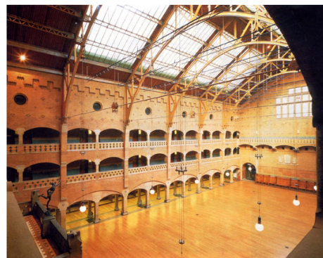
Beurs van Berlage: the Great Hall Plenty of space for posters and booths!